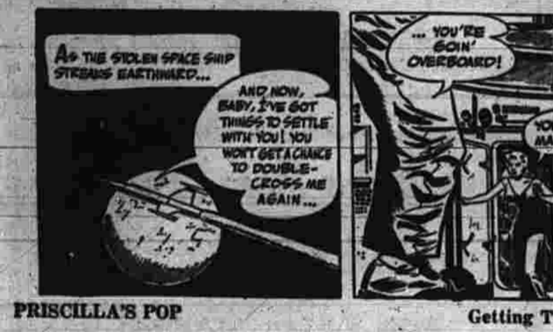
Getting The Business